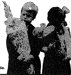
East German children with their Schultüte.

Do you think he will have to sitzenbleiben ? Did you see any students starting school? On their very first school day, at the age of six, they receive a Schultüte full of sweets and chocolates.